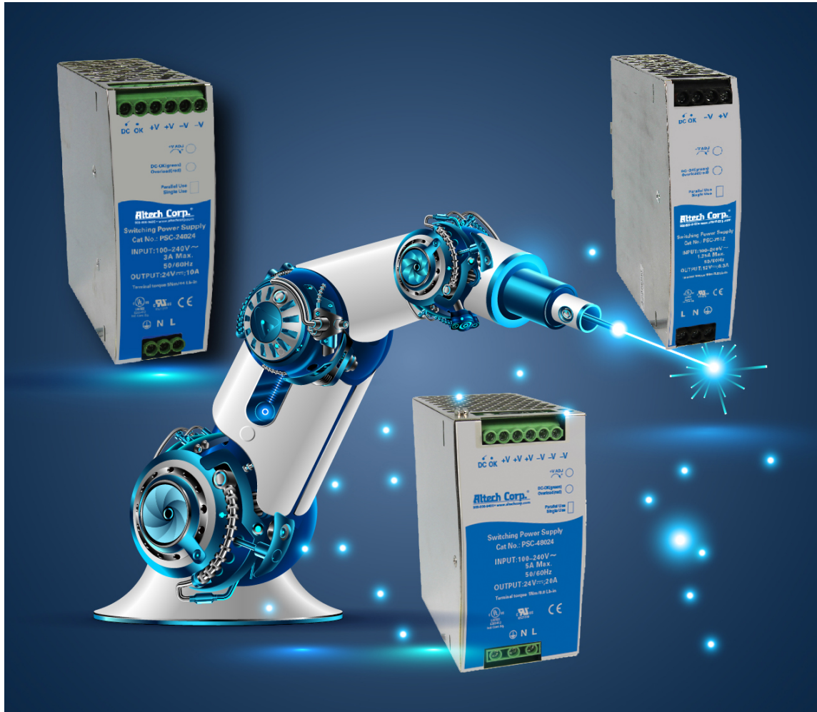
Automation engineers are looking to equipment makers for a new generation of smaller, efficient and rugged DIN rail power supplies.

Automation is the key factor driving enhanced manufacturing productivity. Machines and robots that do not tire, get sick or need vacations will be used in rapidly escalating numbers. But many industrial operations demand humans and robots work together. Often a work cell might comprise humans carrying out highly skilled operations while the small-scale assembly robots complete repetitive tasks thousands of times without error.