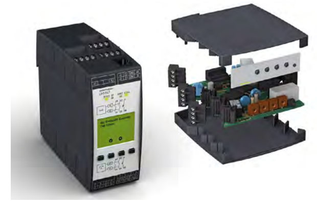
Shown are two customization application examples.

Customization is fairly easy (see Exploded View). When working with the right supplier, they can cut special holes and cutouts for operating, setting, or indicating components that you wish to install, as well as include ventilation slots or special machined entrance points. Terminals can be marked for quick identification and efficiency in wiring as well. Even instructions and custom markings can be