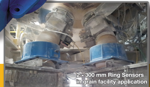
2 - 300 mm Ring Sensors in grain facility application

Various Sizes Various Diameters High Sensitivity Ultra High Sensitivity