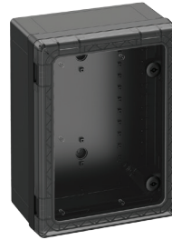
Cat No. 751-434 GEOS-S 3040-18-to/sw black with transparent cover