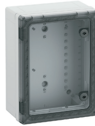
Cat No. 711-434 GEOS-S 3040-18-to with transparent cover