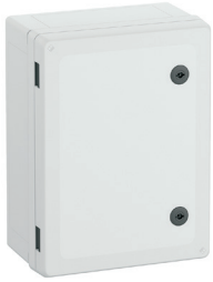
Cat No. 710-434 GEOS-S 3040-18-o with grey cover

* Also available as landscape layout versions GEOS-S 4030, consult Altech.