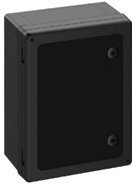
Cat No. 750-434 GEOS-S 3040-18-o/sw black with black cover