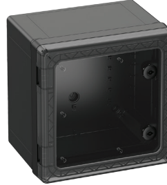
Cat No. 751-733 GEOS-S 3030-22-to/sw black with transparent cover