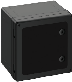
Cat No. 750-733 GEOS-S 3030-22-o/sw black with black cover