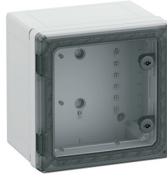
Cat No. 711-733 GEOS-S 3030-22-to with transparent cover