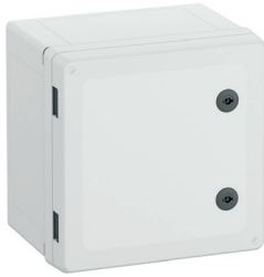
Cat No. 710-733 GEOS-S 3030-22-o with grey cover