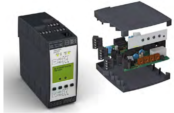
Shown are two customization application examples.

Customization is fairly easy (see Exploded View). When working with the right supplier, they can cut special holes and cutouts for operating, setting, or indicating components that you wish to install, as well as include ventilation slots or special machined entrance points. Terminals can be marked for quick identification and efficiency in wiring as well. Even instructions and custom markings can be imprinted on the enclosures. Some enclosure manufacturers, such as Altech Corp. offer enclosures that can be molded in custom colors and custom configurations when ordered in OEM quantities. Further, some enclosures series offer a modular design that allows the user to incorporate different connection systems such as plug-in terminal blocks with screw or spring terminals (push-in). Series that include different switch cabinet enclosures, distribution enclosures, and a mounting rail bus system—for multifunction, compact, modular, or custom solutions are available.