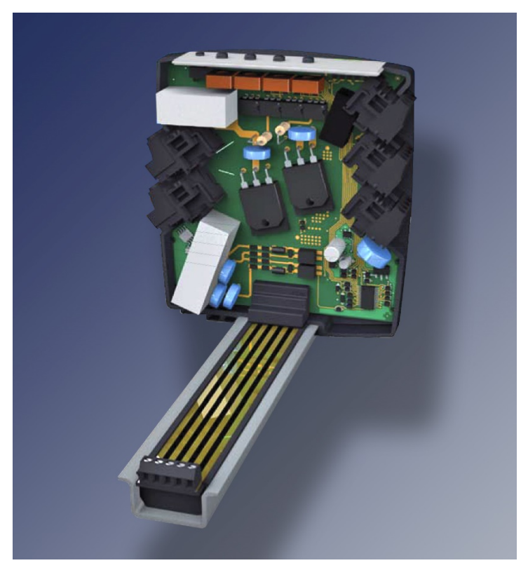
Figure 3. Open view of Altech Corporation KS4400 series DIN enclosure with pluggable terminals populated with PC board and mounted on DIN rail bus system.

components used for setting, adjusting and monitoring such as switches, potentiometers, and LEDs and LCDs. Terminal types include