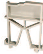
Cooling Spacer Cat. No. 15.960