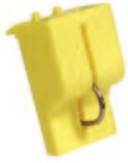
Lock-out * Cat. No. EASS

Prevent inadvertent resetting of the V-EA or MA during maintenance. Fits 1/4" pad lock.