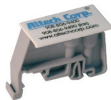
Group Marker, shown imprinted and attached to CA 702. Blank and custom printing available. Cat. No. MTG1