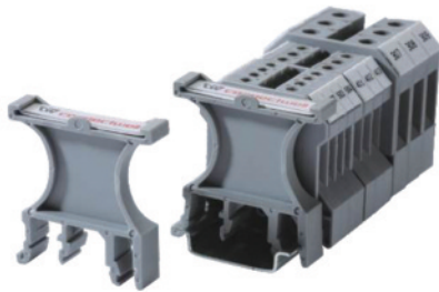
Mountable on All mounting rails Dimension GMH6 46.5(H) x 44.5(W) x 9.5(T) mm

To be mounted directly on Din Rails (GMH6 & GMH7). A marker card needs to be inserted in the slot which is covered by a transparent plastic sheet. (Blank marker and transparent sheet included).