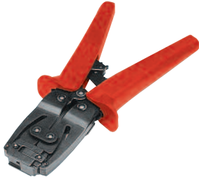
Universal Ferrule Crimper