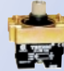
LED Pilot Light