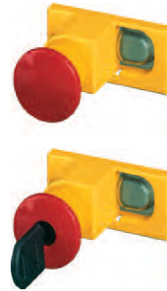
Emergency-Stop twist or key to release, red on yellow background