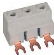
Power Feed Block