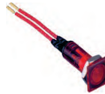
Indicator Light with neon bulb, nominal rated voltage: 220 - 240v or 380 - 440v