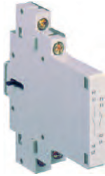
Auxiliary contact blocks for side mounting (3.5A/230VAC; 2A/400V AC)