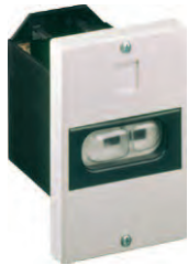
Flush Mounting Enclosure IP55 with integrated pe(N) terminal