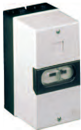
Insulated Enclosure IP55 with integrated pe(N) terminal; top and bottom each have 2 metric knock-outs